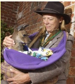
Hunter with a Kangaroo in Western Australia Fall 2003

I am pleased to announce a partnership between Natural Capitalism, Inc. and The Natural Edge Project (TNEP). TNEP is an Australian based non-profit, focused on developing sustainability educational material; promoting and developing best practices in sustainable development; and assisting in the development of integrated approaches to facilitate and implement innovation to achieve a sustainable future.