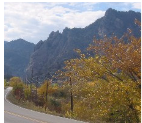
Eldorado Canyon

Natural Capitalism Group completed its first year and accomplished its initial goals with pride. With the addition of Natural Capitalism, Inc. and Natural Capitalism Solutions, my work is continuing to evolve and expand. We are now building on this so that we can respond to the ever-growing interest in sustainability. You may wish to be a partner in making Natural Capitalism a reality. Join us in this endeavor! You can share and incorporate the values of Natural Capitalism into your business and community. You can invite one of us to speak to your local associations, and businesses. At the same time, your donations to our non-profit Natural Capitalism Solutions are always appreciated.