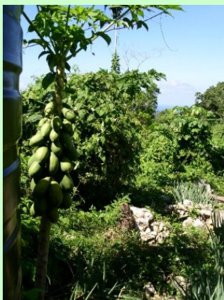
Dolphin Head Trust Jamaica

As adventure tourism, this was doing just fine.