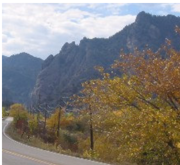
Photo: Eldorado Springs, CO